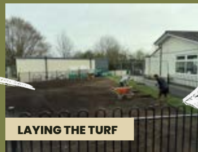
LAYING THE TURF