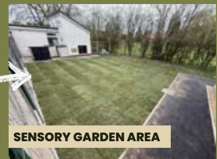
SENSORY GARDEN AREA